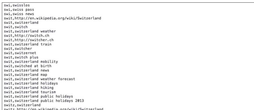
Fig. 5. An excerpt of autocompletion retrievals why typing 'Switzerland' (to the right of the comma are Google's autosuggestions for the expression on the left).

Have you ever misspelled a word in the search query field? Google's algorithms will immediately ask 'Did you mean...?' and suggest the corrected word. Even without misspelling, Google's autocompletion will suggest words and expressions to us before we finish typing . Thus, these algorithms mediate semantically between what we mean and which words we will use to describe it. All of them are so-called 'linguistic prosthesis', potentially impacting the written expression of our thoughts. 16